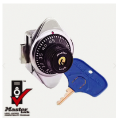
Built-in Combination Lock