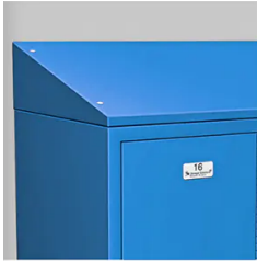
Continuous Slope Hood