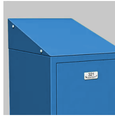
Individual Slope Top/Row End