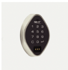
DigiLock® Keypad Locks