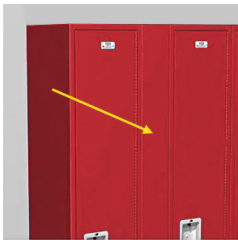
Vertical Filler Panels